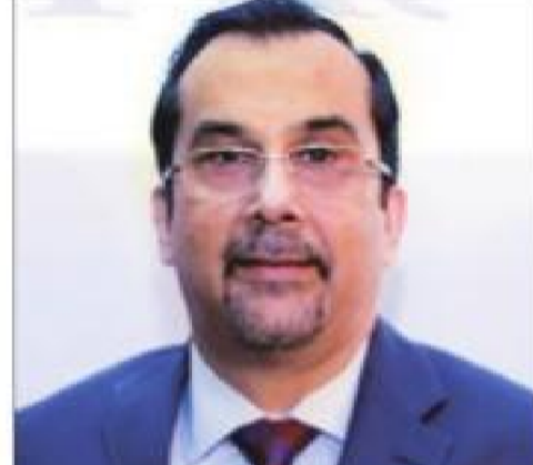
Sanjiv Puri, chairman, ITC

The app has been launched in seven states with over 75,000 farmers grouped in 200-plus FPOs under four value chains — wheat, paddy, soya, and chilli," Puri said. The ITCMAARS platform, a 'phygital' ecosystem, provides farmers with AI/ML driven value-